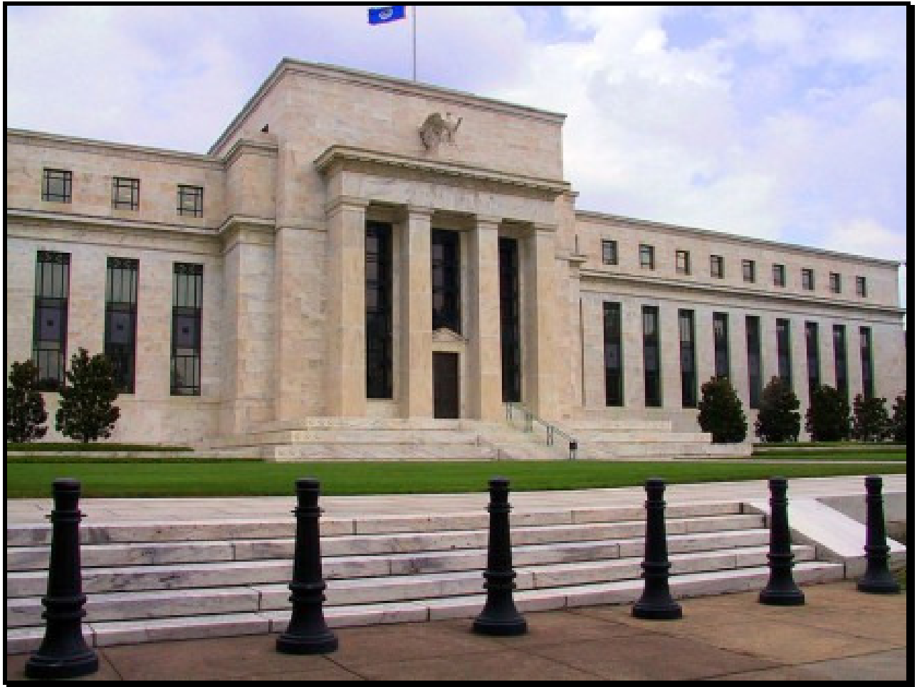
The Federal Reserve (ABOVE) is neither Federal, nor is it a reserve.

Oh, how things would have been different if we had only listened to Thomas Jefferson. Please share this article with as many people as you can. These are things that every American should know about the Federal Reserve, and we need to educate the American people about the Fed while there is still time.